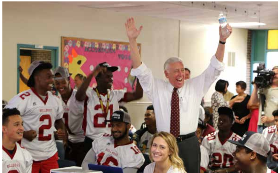
1 Congressman Steny H. Hoyer (D-MD) joined Washington Redskins quarterback Kirk Cousins joined SECU of Maryland, and Visa Inc. in an effort to help high school students sharpen their fiscal skills through the statewide launch of Financial Football, an interactive money management video game.